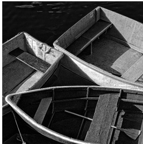
Three Old Boats by Dan Greenberg