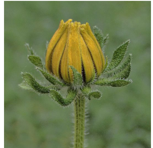
Handle Carefully by Gwen Paton

Visit the Motif Collective website to learn more and enter your images.