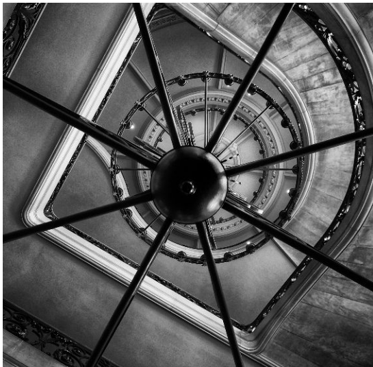
Spokes and Circles by susan p haffke

See all the winning images in the Online Gallery .