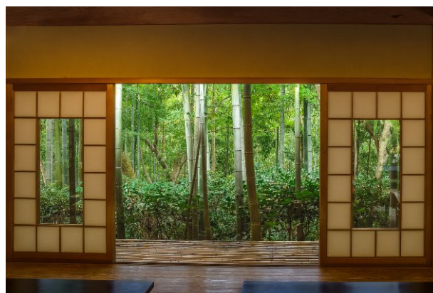
View with a Room by Terry Hanford