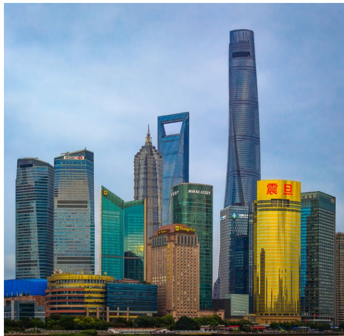
Shanghai Skyline