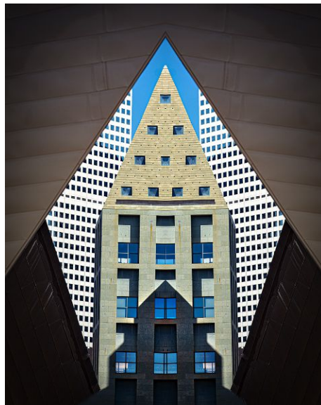
books inside by Travis Broxton