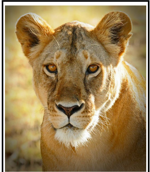
The Look by Elmer Paetow

See their website for all the tutorial posts.