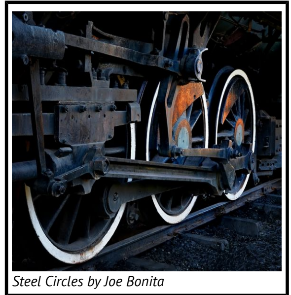
Steel Circles by Joe Bonita

Visit the KelbyOne website for full details and entry info.