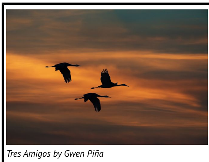
Tres Amigos by Gwen Piña