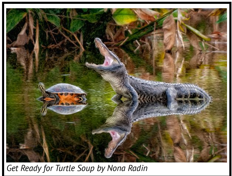
Get Ready for Turtle Soup by Nona Radin

Registration info, rules and prize lists are at the contest webpage . Be sure to read the rules and FAQ about how much editing is allowed on the submitted images.