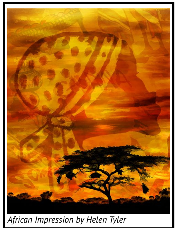
African Impression by Helen Tyler

If you need the Competition Entry forms or the template for the stick-on labels, you can get both from the Focus website on the Competition Rules page.