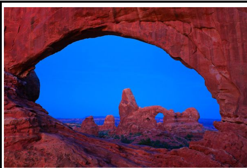
Eyeing Turret Arch by Tim Visser

Full details and entry info is at the contest webpage .