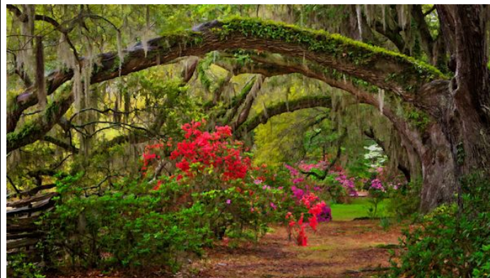
Cyprus Garden by Nona Radin