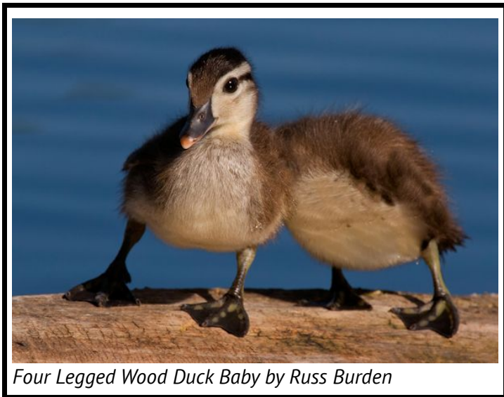
Four Legged Wood Duck Baby by Russ Burden

Dec. 6 - 12, Bosque Del Apache & White Sands Natl. Monument