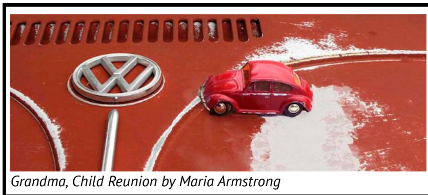
Grandma, Child Reunion

Get full details at the website , and use coupon code AMPHOTO to get the $59 discounted fee (reg $129).